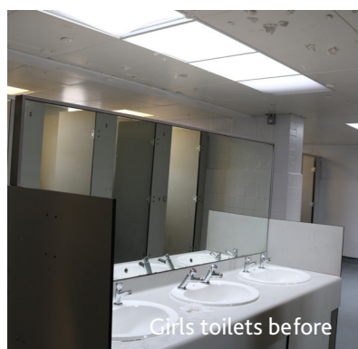
Girls toilets before