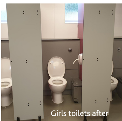
Girls toilets after