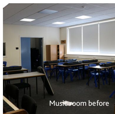
Music room before

This summer was again a busy time for our Premises Team who worked very hard to deliver a large number of improvements to the School before it reopened at the beginning of September. Here are some of the highlights: