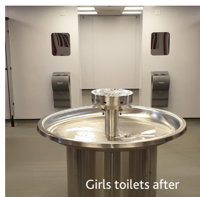
Girls toilets after